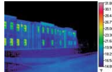
Figure 2 Thermographs of a high performance precast building show that the exterior concrete surfaces have a nearly uniform temperature, verifying the lack of thermal bridges or air leaks. Only the windows and parapet areas show higher local temperatures.

consider optimization, not just proper operations. ASHRAE Guideline 32P, “Sustainable High Performance Operation and Maintenance” provides guidance on optimizing operation and maintenance of buildings to achieve the lowest economic and environmental life cycle cost without sacrificing safety or functionality. In addition, the building should be properly pressurized and the HVAC dehumidifying properly.