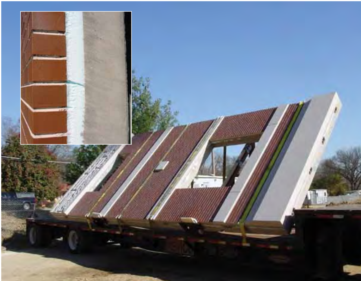
Figure 1 Insulated sandwich wall panel with continuous edge to edge insulation..

As an added benefit, indoor temperature fluctuations are reduced and occupant comfort is enhanced. The required capacity of the heating/cooling equipment is also reduced, lowering initial costs as well as ongoing operating costs since smaller equipment running continuously uses less energy than large equipment running intermittently. (See Designer's Notebook "Energy Conservation and Condensation Control", www.pci.org/publications .)