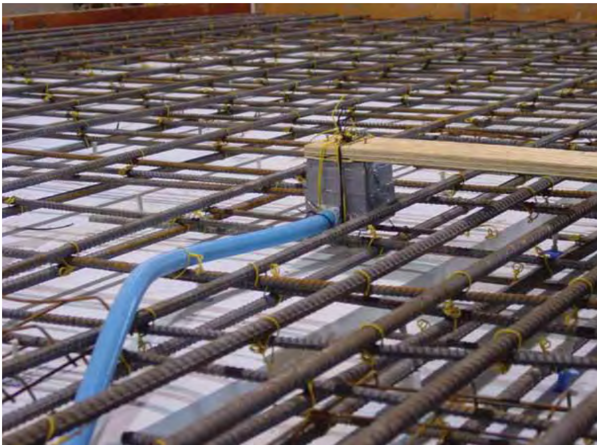
Figure 4 Electrical conduit and outlet box being installed in insulated sandwich wall panel.

Combining loadbearing wall panels with an economical precast structural floor system creates long, clear unobstructed spans with large, open bays with interior heights up to 55 feet. In most cases, the height is restricted only by what can be transported and delivered to the site. For offices, 45 to 50 foot spans are optimal because beyond that length, bays become so deep that daylighting is compromised.