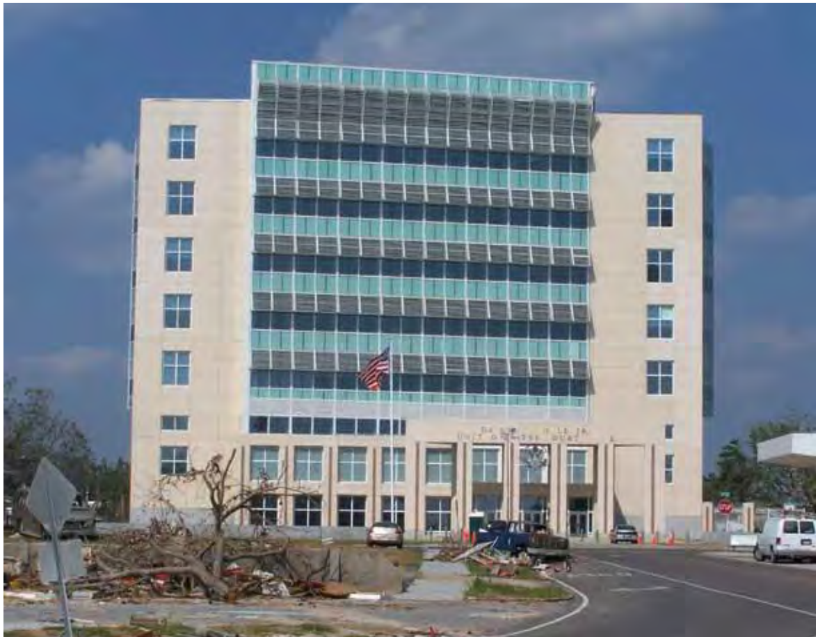
Figure 5 Insulated sandwich wall panels provided excellent protection from hurricane force winds and flying debris.