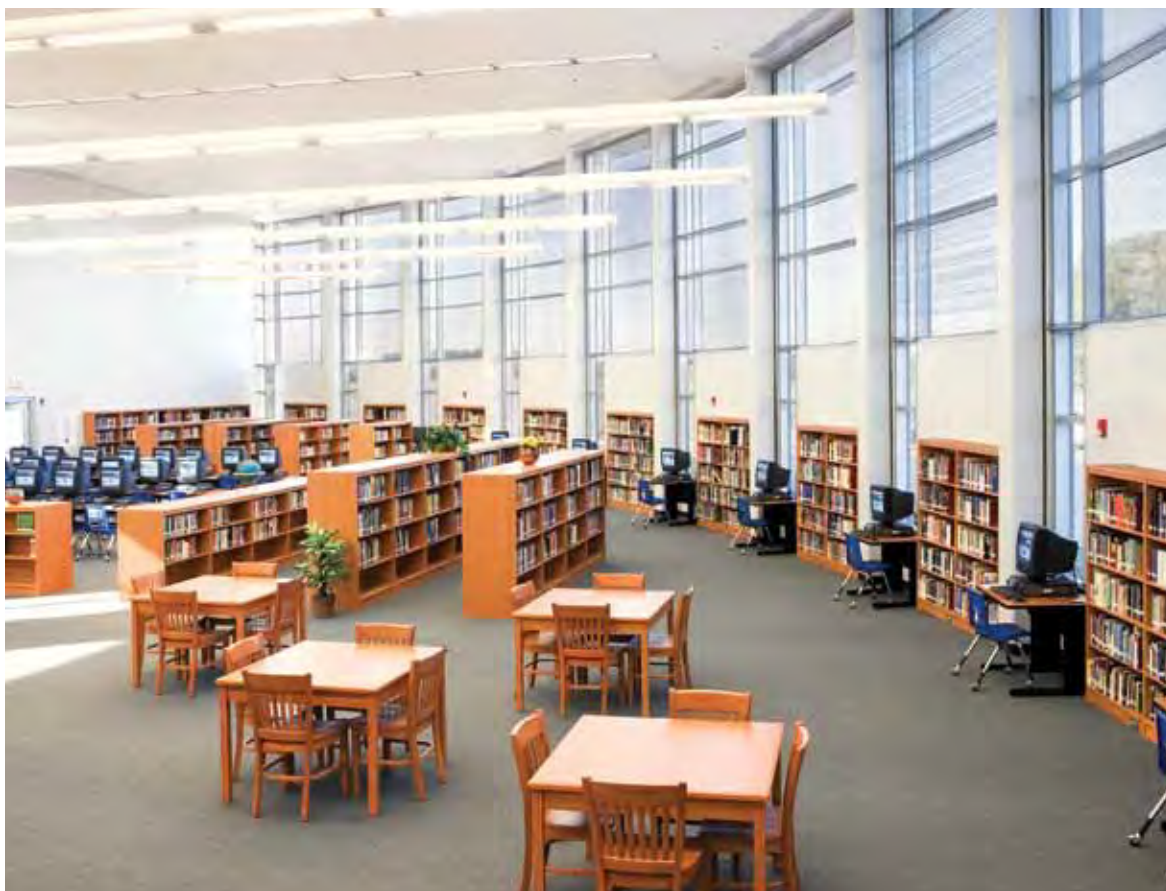
Figure 3 The insulated sandwich wall panels of the high school media center allowed the interior finish to be exposed painted precast concrete..

cycle cost of replacing joint sealants and add value to the client's project. Typically, the only maintenance precast concrete panels require is recaulking (service life of caulking depends on sealant material, installation, and exposure conditions). Joint sealants should annually be inspected and repaired if necessary. Precast concrete panels present a durable, aesthetically pleasing exterior surface that is virtually air and watertight and does not require painting. Within a building's interior, precast insulated sandwich wall panels provide a finished steel trowelled surface that doesn't require furring or drywalling after installation, eliminating some interior work. They can be left exposed or painted (Figure 3.) They also eliminate the need for separate insulating and finish subcontractors. Integral finishes not only result in a savings of material and labor, but also reduce the overall thickness of the exterior wall, permitting maximum interior space utilization.